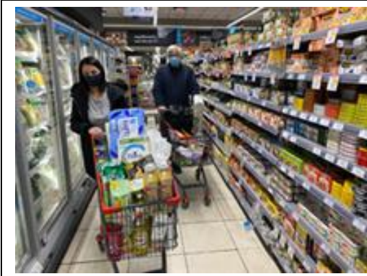
Relief fund program Buying groceries for church families.

them and mostly making them feel they have not been left alone. We go by the motto that, “if you love you will find the way, if you do not love you will find the excuse” . There is plenty of work to be done, but we are alone since our coworker has left for the States. But even so, we pray to the Lord to give us the needed physical strength to continue.