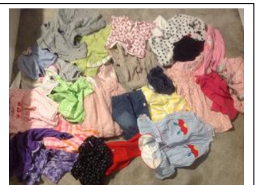
Mata is collecting baby clothes this period which we store at the church building and also take to brethren with new born babies.