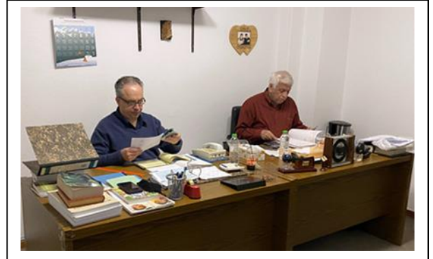
Working at the church building on the church finances