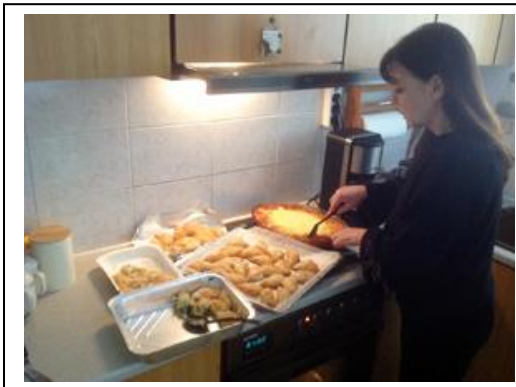
Mata preparing food which I deliver to families in need