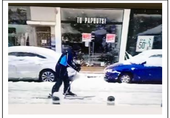
Unbelievable - Skiing in Athens